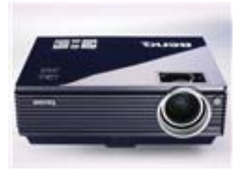
BenQ MP721C PROJECTOR Worth $2,000