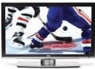
NEC PX-42XR5W 42" Plasma Worth $3,000