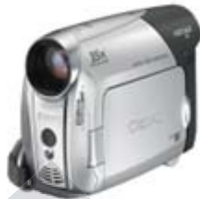
Canon MD120 Digital Video Camera Worth $500