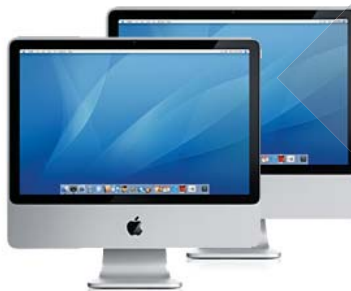
2 x iMac 20inch 2.0 Ghz Worth $3,500 total