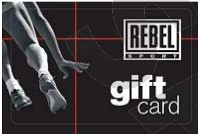
Rebel Sport Gift Card Worth $200